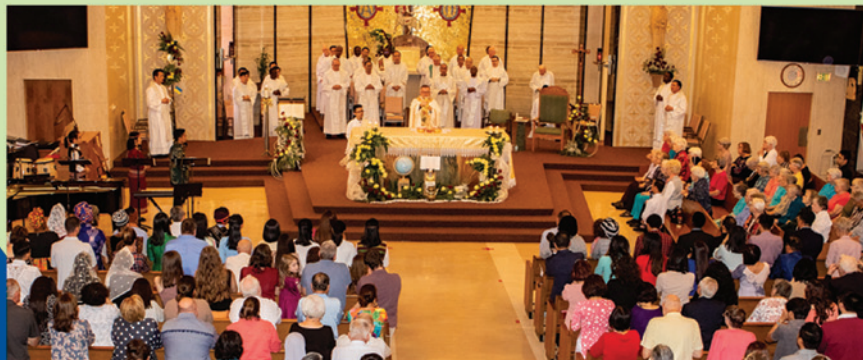
Mission Sunday celebration in October 2022