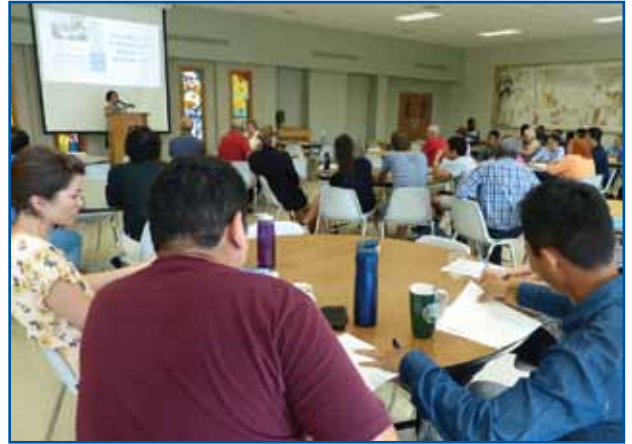
Tutor Orientation at the beginning of the new school year. ESL students and instructors met with 26 tutors from surrounding communities and Emmaus Bible College to review guidelines and answer questions.