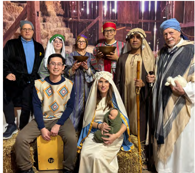
Epworth Country Christmas 2024.

Also, there is a signup sheet posted on the student bulletin board needing helpers to help with the games and activities. We ask you for your help to make this event joyful.