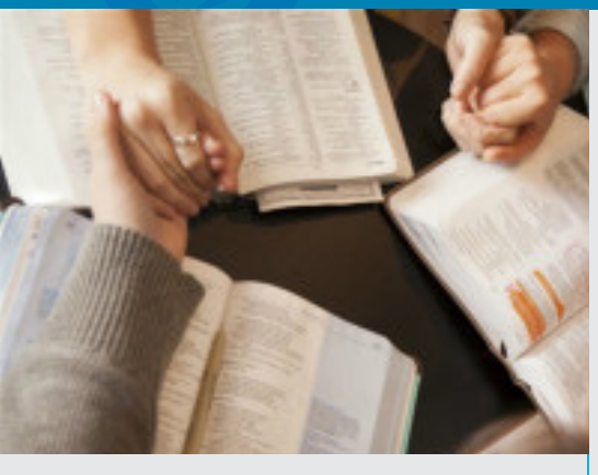
"God loves each of us as if there were only one of us"