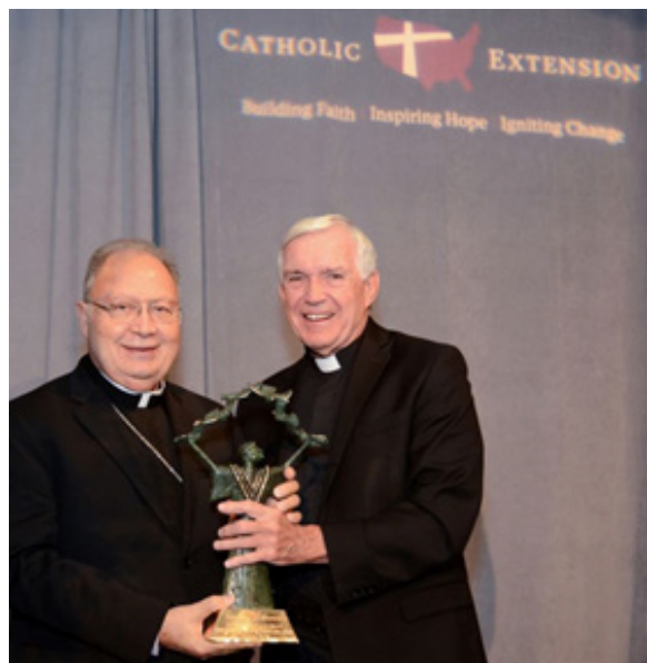
Bishop Curtis Guillory SVD and Fr. Jack Wall

Catholic Extension, a papal society founded in 1905, is dedicated to building up Catholic faith communities in the poorest and most neglected areas of the United States. The Chicago-based organization supports the construction of churches, invests in the education of Church leaders, and funds religious education and outreach programs for young people. The members of the organization are answering Pope Francis' call to go out to America's peripheries.