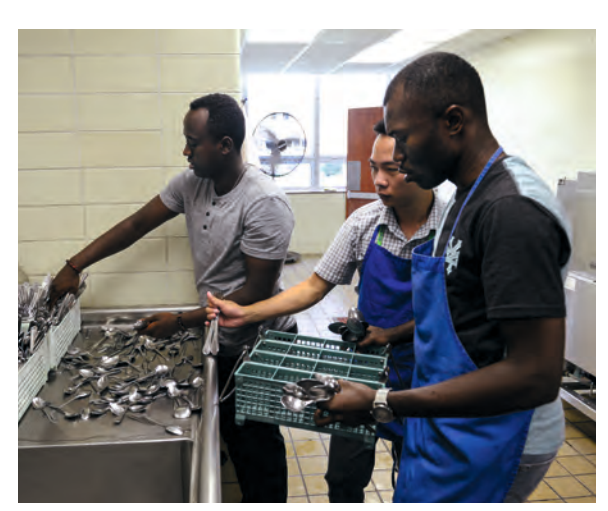
Young Helper Future missionaries should help out with everything. So that they are made fit for their commitment.

religious from other orders, that sets the tone for the whole undertaking named mission."